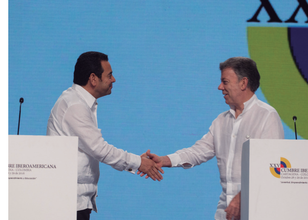
Closing of the 25th Ibero-American Summit at Cartagena de Indias (2016). Juan Manuel Santos, President of Colombia, greets Jimmy Morales, President of Guatemala, the host country of the 26th Ibero-American Summit in 2018.

A number of meetings, forums and gatherings are held over a two year period working on topics of interest for the region. A path that culminates with the convening of the Ibero-American Summit of Heads of State and Government.