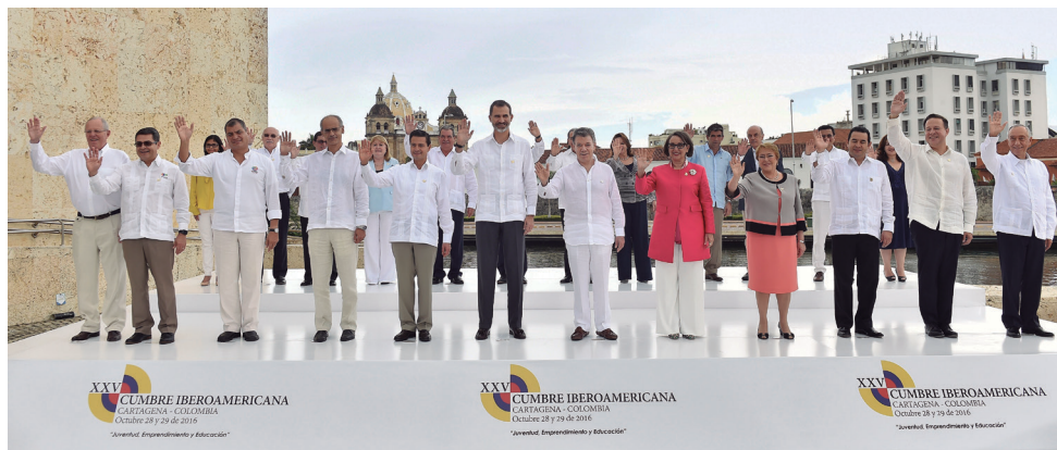
Group photo of the 25th Ibero-American Summit of Heads of State and Government held in Cartagena de Indias (Colombia) on 28 and 29 October 2016.